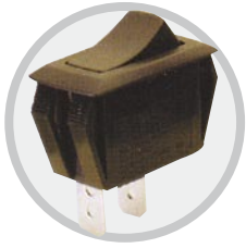
RL1-511-C-0-BK/BK-P2 ON-OFF 2P